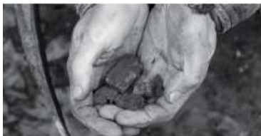
Raw materials are in line with humane mining and operations